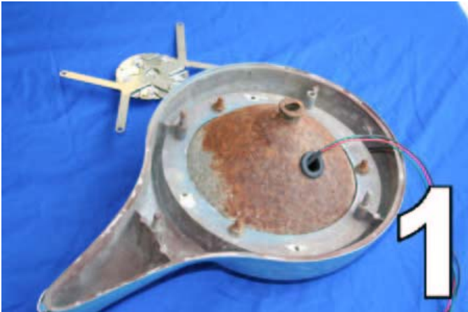
Install the supplied rubber grommet and pass the LED wire through the taillight and grommet as shown.