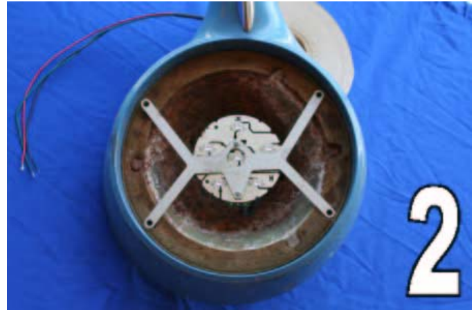
Correct placement of LED array.